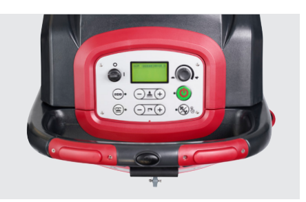
Intuitive control panel with LCD screen for all models (AS6690T/AS7690T pictured)