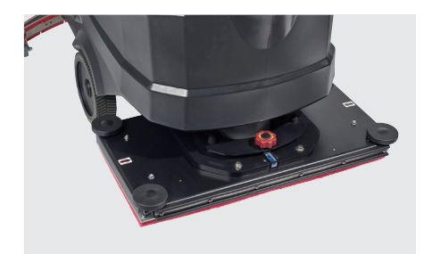
Orbital scrubber for floor cleaning or coat stripping (AS7190TO)