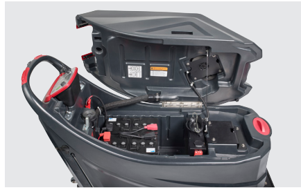
Recovery tank with hand grip for easy tilting